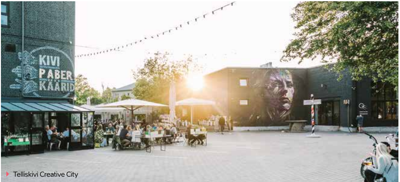
▶ Telliskivi Creative City

Industrial heritage and bohemian charm. In recent years, the historical Port Noblessner and the Telliskivi Creative City have become the most popular leisure centres among the locals. The vibrant and artsy Telliskivi area is also often called the hipster district, as you can find a lot of artistic expressions, creative culture and little funky cafes and bars from there.