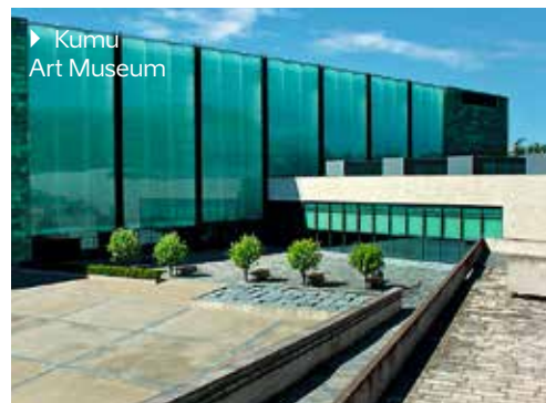
▶ Kumu Art Museum