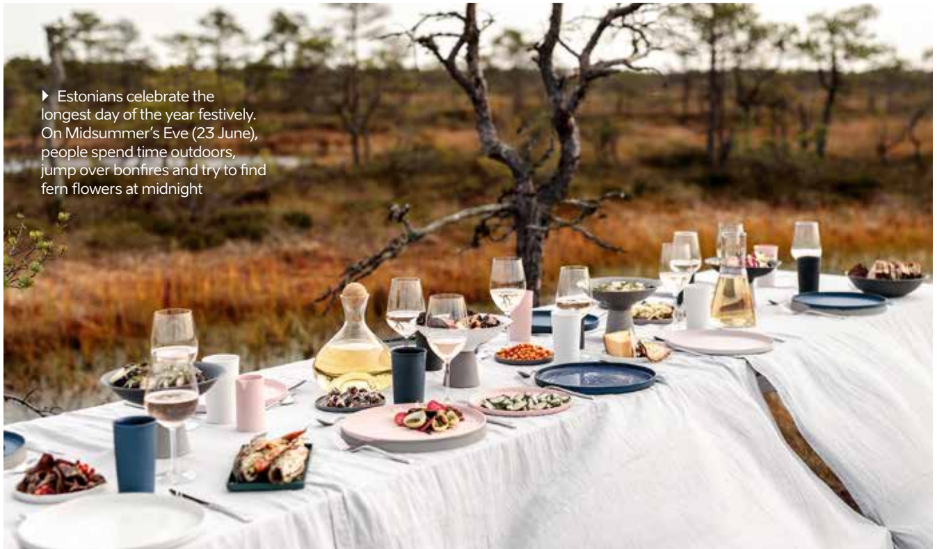
► Estonians celebrate the longest day of the year festively. On Midsummer's Eve (23 June), people spend time outdoors, jump over bonfires and try to find fern flowers at midnight