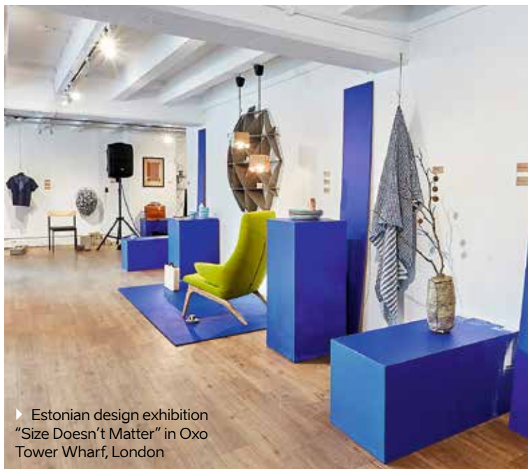
▶ Estonian design exhibition "Size Doesn't Matter" in Oxo Tower Wharf, London

Estonia is also well known for 'Estonia' pianos, Estelon speakers and Paiste cymbals.