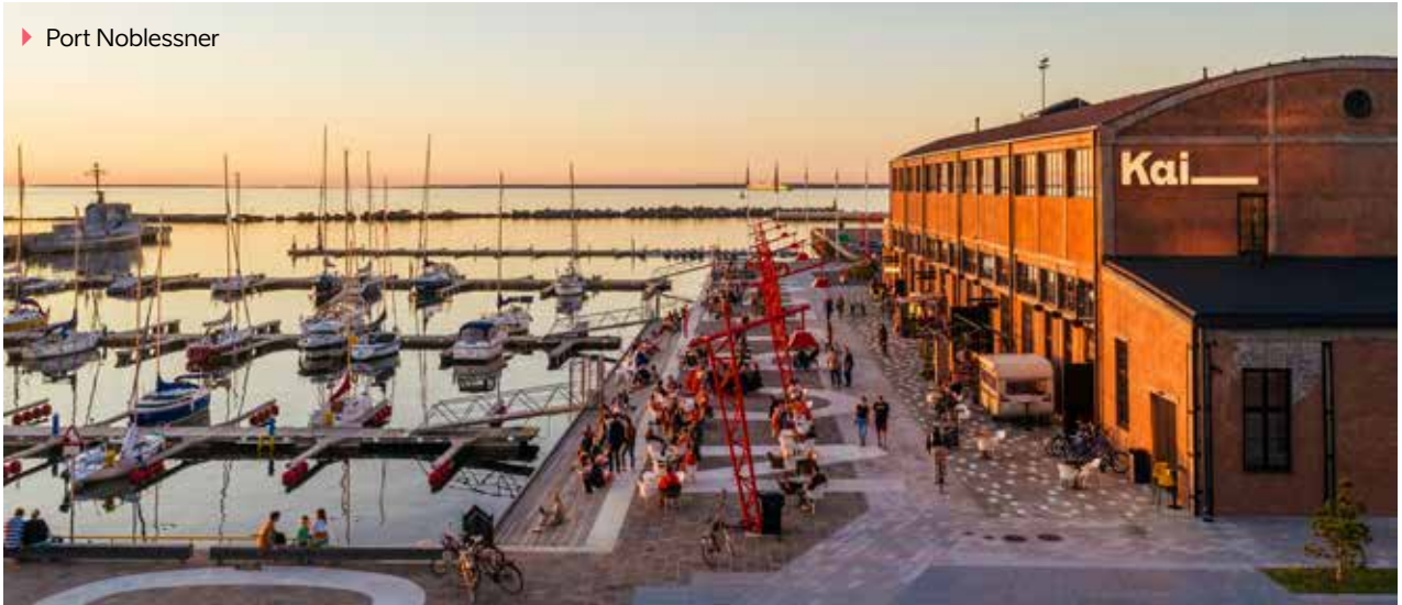
▶ Port Noblessner